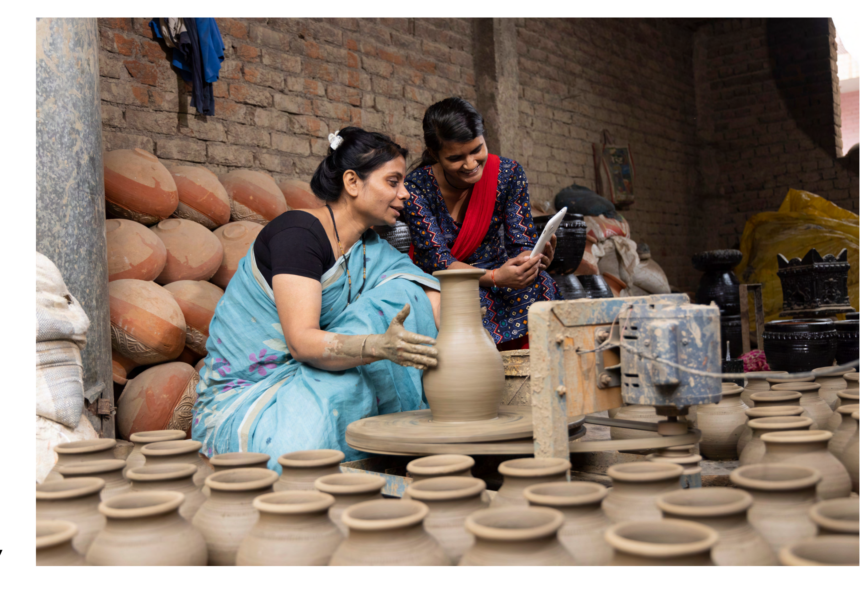
Maximise your impact

Imagine the impact your brand could make by sponsoring ethnic women artists setting up a vibrant display of their exquisite creations, captivating attendees with the stories behind each piece. This is your opportunity to create a lasting impression and align your brand with the values of empowerment, creativity, and cultural appreciation.